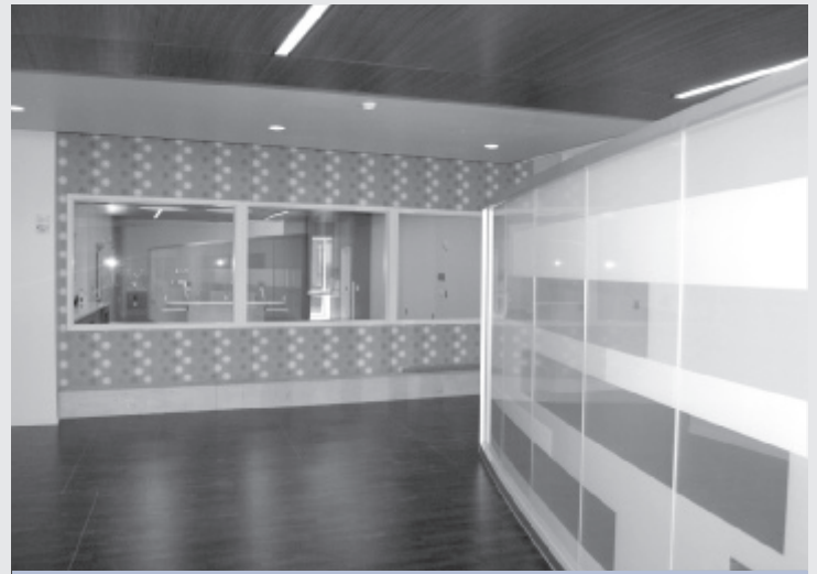
The nursery, located on the fourth floor, is a bright and welcoming space for family and friends to catch a first glimpse of newborns.

Leadership in Energy and Environmental Design (LEED) inspections.