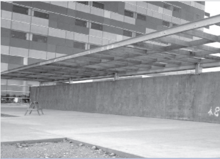
The trellis in the Abell-Hanger Courtyard will provide shade for a sitting area bordered by the donor wall.