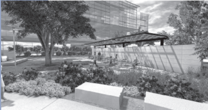
Artist's rendering of the future Abell-Hanger Courtyard