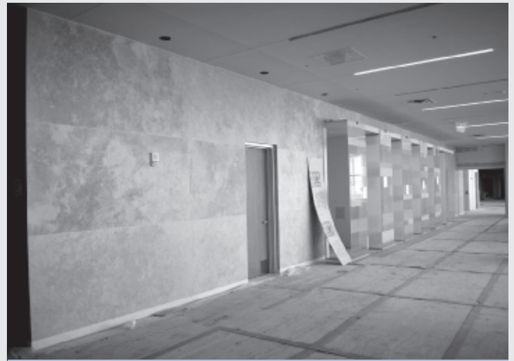
The new patient registration/admission cubicles, conveniently located on the first floor of the tower, allow for much-needed privacy and security for patients who are being admitted to MMH.